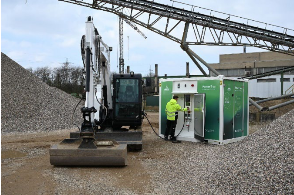
Caption: The electric-powered excavator can be charged rapidly using the PowerTree.